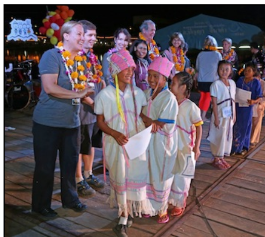
Children receive 1000 baht ($31) scholarship at the Small World Maehongson Festival Dec. 2013.